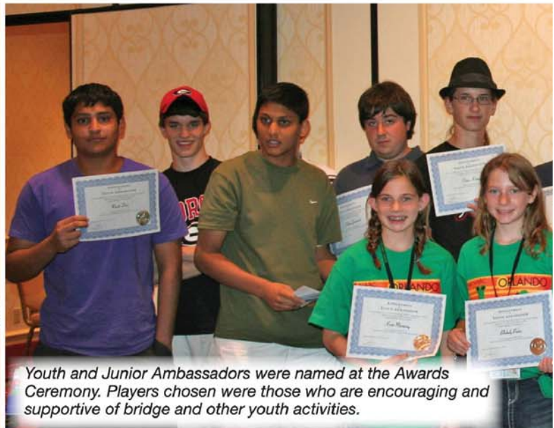
Youth and Junior Ambassadors were named at the Awards Ceremony. Players chosen were those who are encouraging and supportive of bridge and other youth activities.